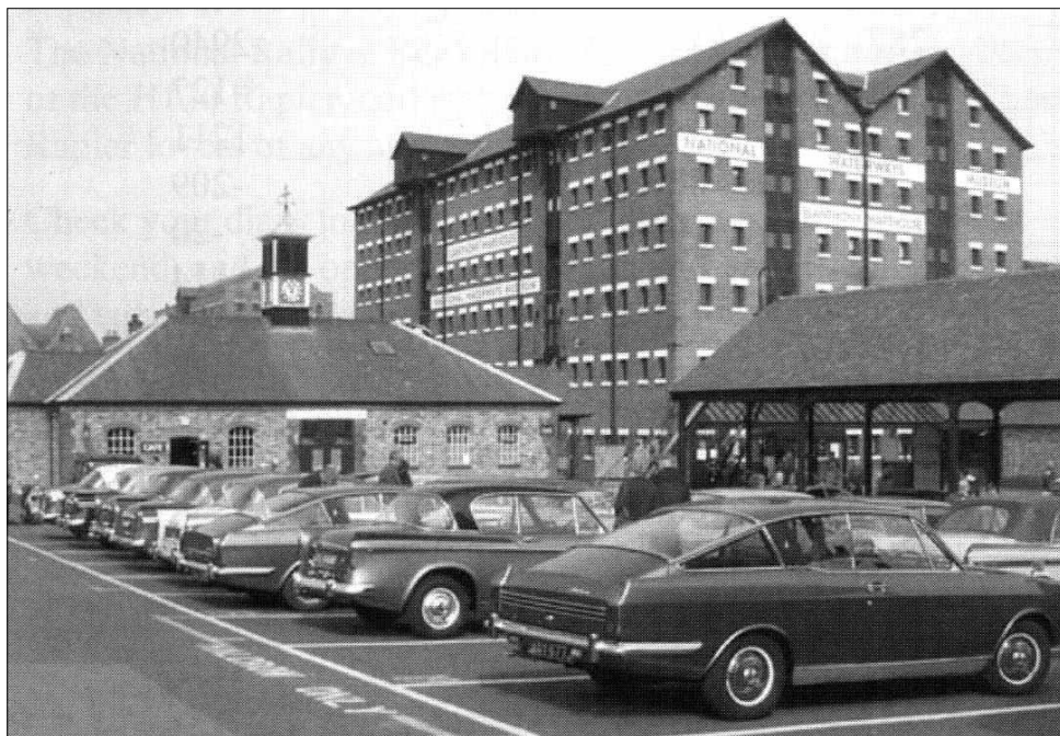
Rapiers lined up in 2003 - Look for those tall buildings when you arrive