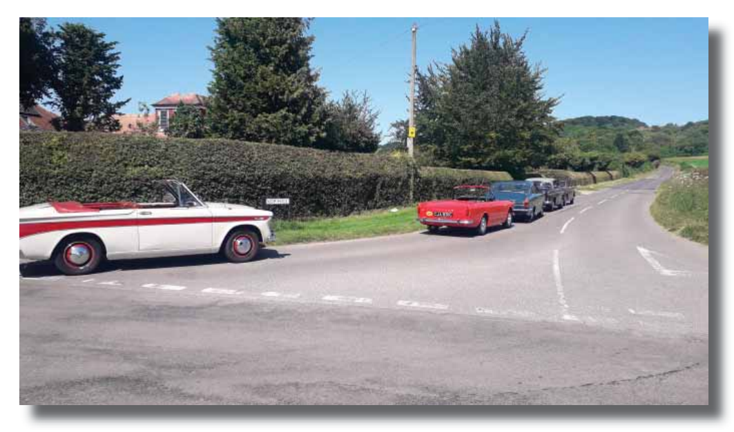
The foot of Kop Hill road in the Chilterns and a selection of Rootes finest wait to try their hand.....

In the afternoon we took a nice countryside drive out to Buckinghamshire and the lovely hillsides of the Chilterns. Close to the Prime Minister's country retreat at Chequers nestles Princes Risborough, a small village that in the 1920s hosted regular hill climb events on its famous Kop Hill, an almost straight half mile road rising from the valley below. The idea in the day was to see how fast you could reach the top, according to Wikipedia the record is some 22 secs, which for a car 100 years ago was amazing. A weekend in mid-September is now set aside to emulate those events and great fun it is too. Nowadays speed gives way to showmanship, as veteran cars with Edwardian clad ladies and gents puff up the hill followed by supercars leaving rubber trails on the tarmac; nobody is now timed.