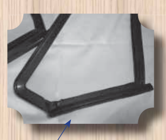
4: Fastback quarterlight seal. Special offer £80 per pair (members only). Contact: Peter Lawrence

have stock. Editor: We understand that these are now for sale on the website of "Forest Custom & Classic Spares" under their Alpine section.