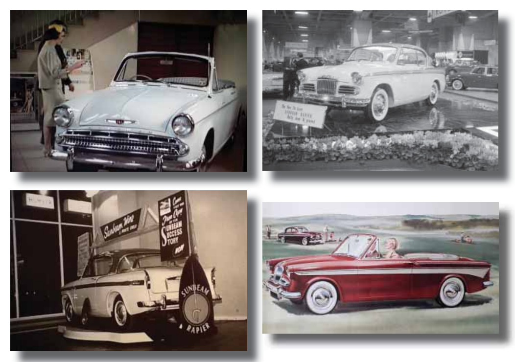
Models would then be displayed in showrooms, at motor shows and on brochures, to be sold to adoring husbands and wives around the world.

Eager buyers would turn up on the allotted day to have their lovely new Rootes car waiting on the forecourt. Ahhhh how proud they look and the garage has even transferred their grille badges over for them as well, now that is great 50s style service, an extra 10-bob please.