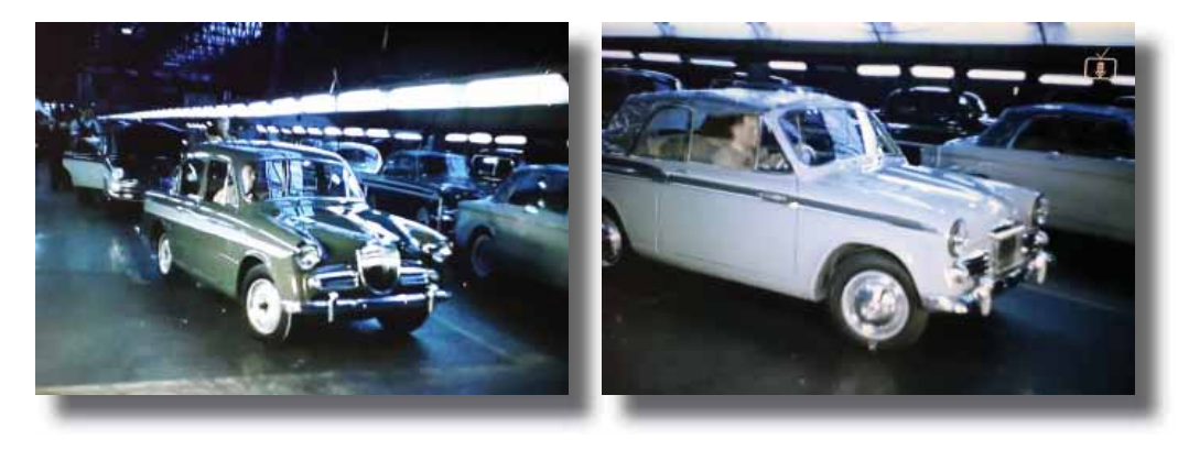
Eventually streams of shiny new Minxes, Gazelles and Rapiers would emerge (in no particular order), fully completed, from the Ryton production line.

Back at Ryton and almost nearing completion.