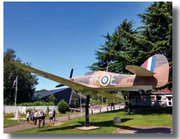
Adorning the entrance to RAF Uxbridge

Now, think back to the classic post-war war films that used to be shown on TV on a Sunday afternoon. In many of them there are shots of WAAFs around the plotting table with headphones on, calmly moving blocks around the map to indicate where the RAF planes are, where the Luftwaffe planes are, plotting interception courses and so on. This is what actually happened in the main room of the bunker while defending SE England. On the wall there is the indicator system for the seven sector stations for which No 11 Group was responsible: RAFs Kenley, North Weald, Debden, Biggin Hill, Tangmere, Hornchurch and Northolt, and then each of them linked in turn to their own satellite airfields.