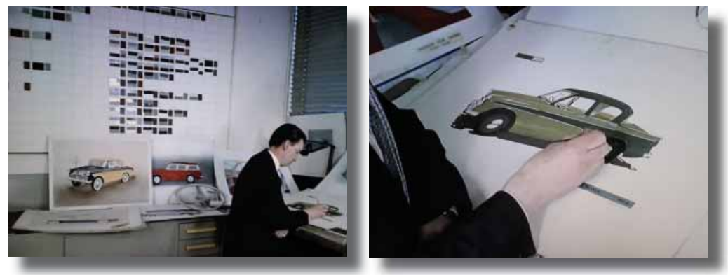
Initial outlines were worked up with sharper graphics, ready to show senior management.

transformation. Tim's idea was that flashy new fins would be stitch welded to the tops of the existing rear wings, with a newly designed front end with more chrome and cowled headlights providing a more elongated, sleeker, lower feel.